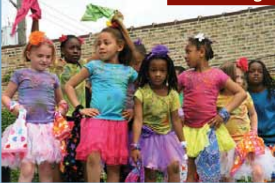
Kuumba Kids, an African dance performance ensemble showing their moves at Chicago's HVAD event.