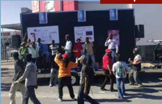
The Desmond Tutu HIV Foundation in Cape Town conducted a community drive in collaboration with its CAB to promote HIV prevention. They also distributed condoms and information flyers on HIV prevention research information.