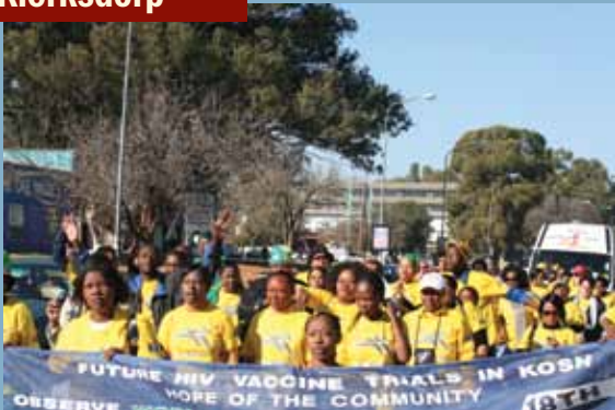
The KOSH site in Klerksdorp commemorated in the spirit of the World Cup which was only 3 days away.