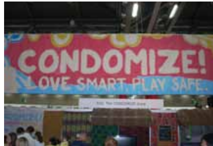
"Condomize" one of the many prevention campaigns displayed at the Global Village.

to fulfill their funding commitments to the Global Fund for AIDS, Tuberculosis and Malaria, and featured slogans like "Broken Promises Kill" and "No U-turn: Fund the Fund." Marchers advocating for the rights of sex workers and other women carried red umbrellas and distributed buttons saying "Only rights can stop the wrongs." These human rights themes were reiterated loudly throughout the week, as various groups pointed out the challenges experienced by drug users in Eastern Europe and Central Asia, men who have sex with men around the world, those living with HIV and co-infected with TB, and youth. The Vienna Declaration is one example of this demand for human rights, calling for a shift to evidence-based interventions for drug users instead of plans based on ideology. (People are welcome to read and sign on to the Vienna Declaration at http://www.viennadeclaration.com/ .) On Tuesday evening, July 20, there was a human rights march through the streets of Vienna, filled with banners and slogans from all of these groups and more, not to mention the sounds of drums, South African horns called vhuvhuzelas , whistles, and thousands of voices. The march concluded symbolically in Heroes Square, surrounded by the beautiful Hofburg Palace, where singer Annie Lennox gave a concert for the assembled crowd.