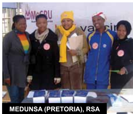
MEDUNSA (PRETORIA), RSA

► What better way to celebrate HVAD than with the volunteer firefighters of Lima? Site staff shared information and updates on HIV prevention including HIV vaccine studies. It was a day of active participation and enthusiasm as everyone reflected on what it would take to find an effective vaccine for all.