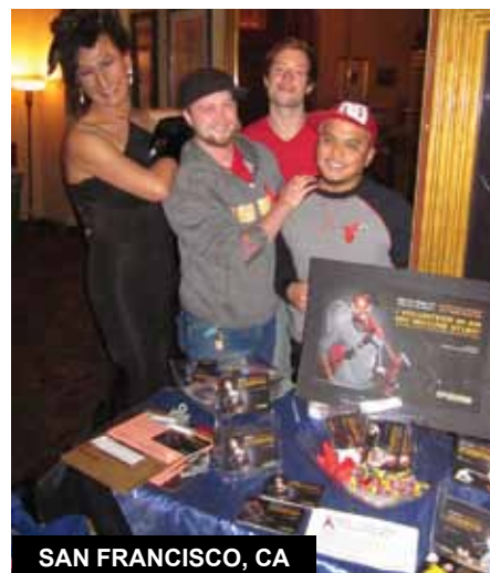
SAN FRANCISCO, CA

► Medunsa's theme for HVAD was "It takes a village to fight HIV/AIDS." CAB members joined with the site to provide education and awareness about preventive HIV vaccine studies, testing options and other health issues.