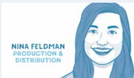
NINA FELDMAN PRODUCTION & DISTRIBUTION