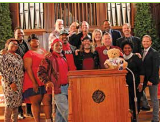
Site staff at the 2017 World AIDS Day Event

One in two African-American men who have sex with men in the US will contract HIV in their lifetime if current trajectories continue uninterrupted. In the South, this statement issued by the Centers for Disease Control in early 2016 was not only a challenge to HIV prevention educators and researchers, but it was also a demand. We simply must be laser-focused in engaging, educating, and most importantly, retaining these underserved members of our human family.