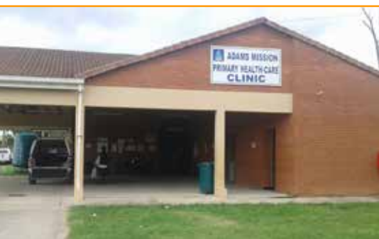
Front of Adams Mission Health Clinic

When the study staff heard of the concept of AMP, they could not envision such a thing happening. Questions arose about whether healthy people would consider having a foreign substance infused into their bodies via a drip. A drip, after all, was understood to be for individuals who had something wrong with them.