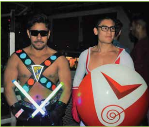
Pumax (l) and Vacuman (r)