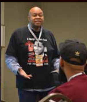
Wakefield opening the Joint Institute Session on anal health.